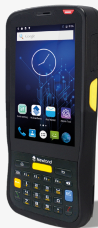
MT65 Beluga IV mobile computers